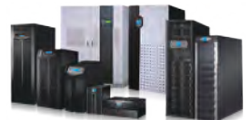
Delta offers full range UPS solutions from 600 VA to 4000 kVA to fulfill your power security needs.