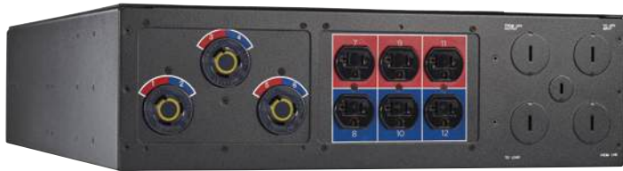
Rear panel of Eaton's BPM125ER model

Note: "R" models include four-post rail kit; 125A "HW" model does not include rail kit.