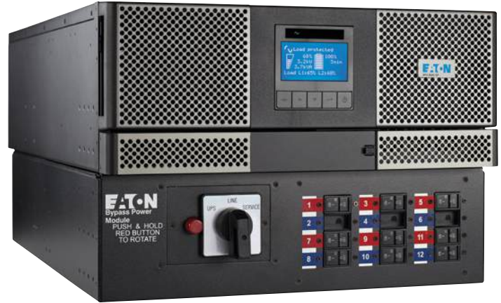
Bypass Power Module shown here with Eaton's 9PX6KSP UPS model

For additional information on Eaton's Bypass Power Module, visit Eaton.com/BPM